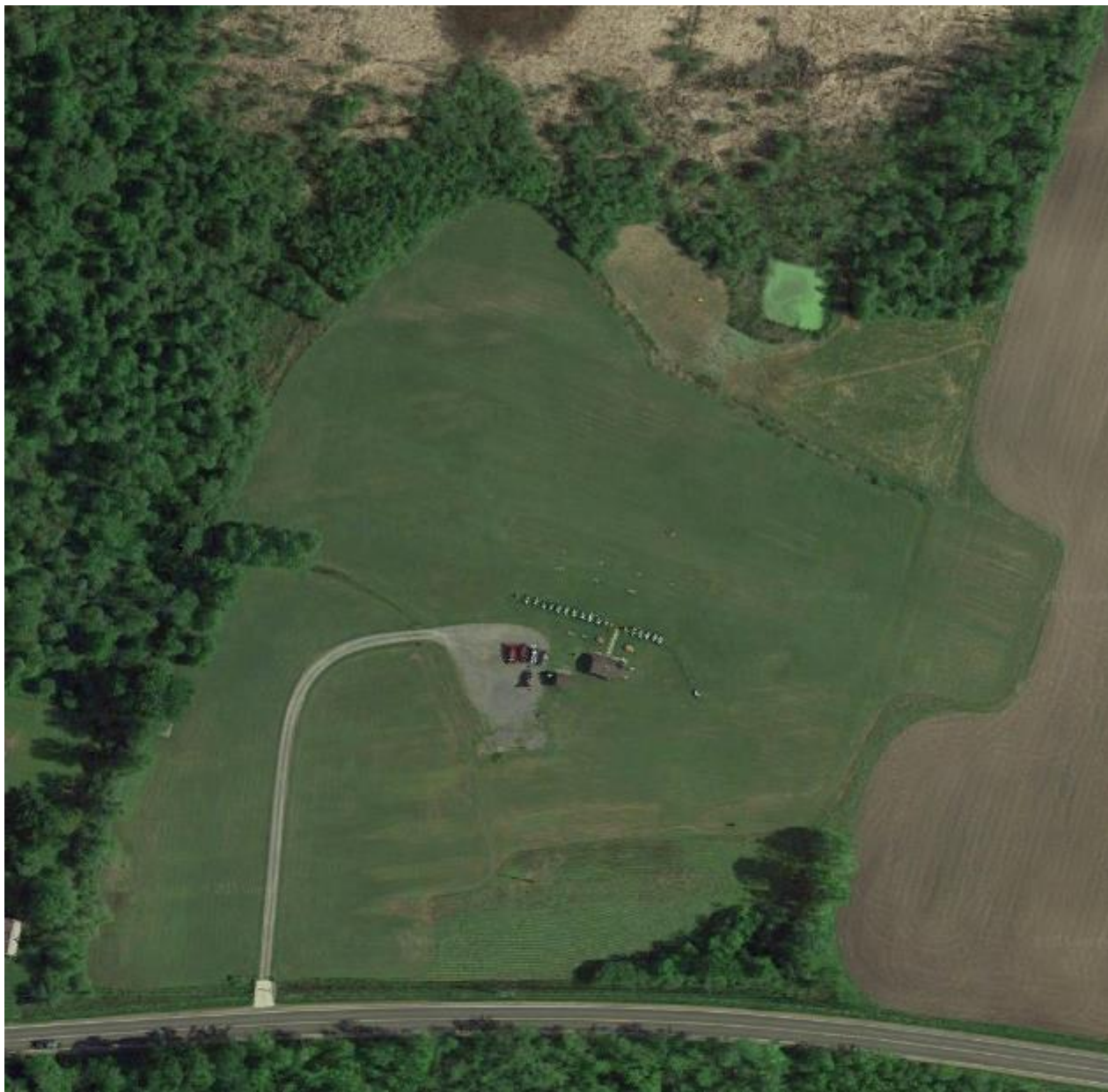
STARS Field Satellite photo